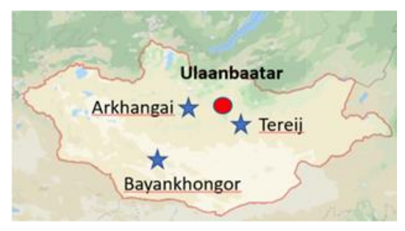
Figure 4 L.110 Cable deployment sites in Mongolia

Cable installation speed was 3-4 km per day, where typically 50% was aerially suspended using existing poles, and 50% was buried.