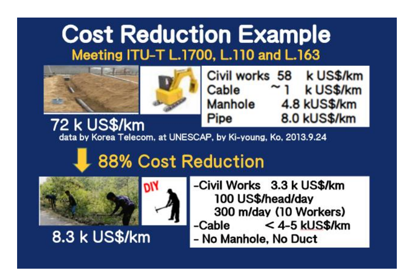
Figure 2 Cost Reduction example of L.110 Cable and its construction