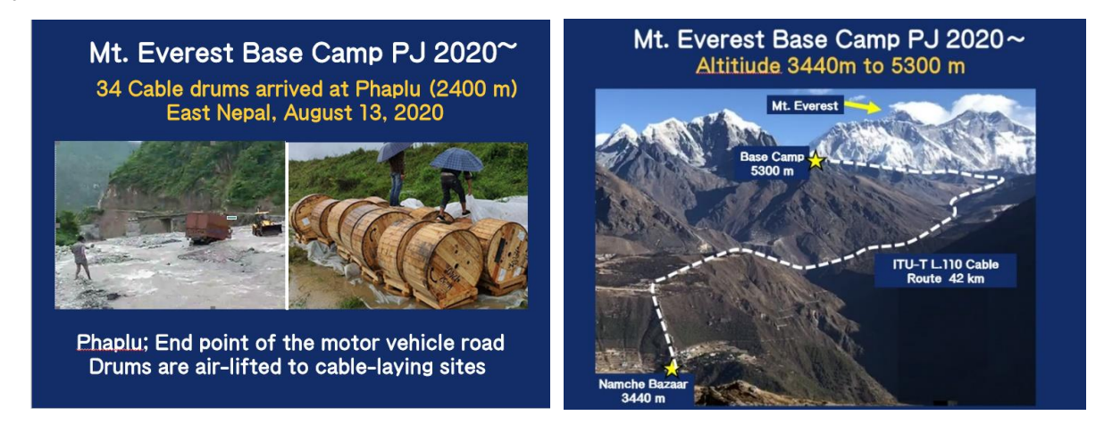
Figure 5 The cable drums arrived at the site, and the cable route

A total 42 km of L.110 cable was separately wound up on the 34 cable drams and brought into Phaplu (heliport) that is the endpoint of the vehicle road. The cable is waiting for air-lifting as of Sept. 7, 2020.